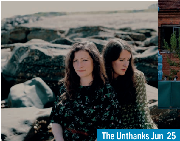
The Unthanks Jun 25