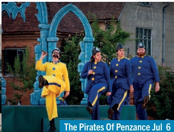
The Pirates Of Penzance Jul 6