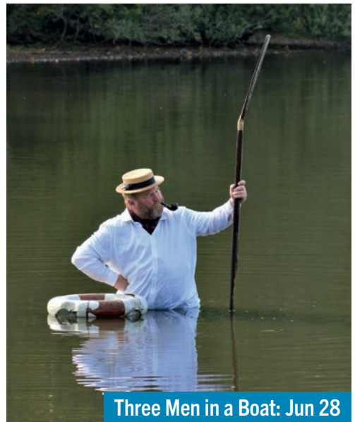
Three Men in a Boat: Jun 28