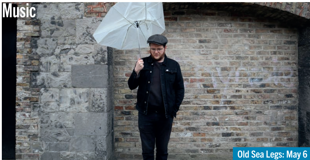
Old Sea Legs: May 6

After a false start at the beginning of the year gigs at Ropery Hall are back in full swing. We have some interesting evenings ahead leading into the summer with great musicianship at the heart of every show and a definite Irish influence to the programme.