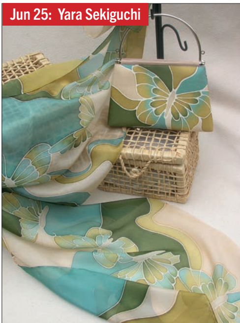
Jun 25: Yara Sekiguchi

This workshop will cover the outline technique using 100% pure silk and specialised French dyes. This is a basic course which can be followed up by an intermediate variation with different techniques/projects. A design of your choice will be achieved using the Gutta outline technique (imagine a stained-glass type of style). This workshop is suitable for beginners and the technique will be explained step by step in a very relaxed and fun way. At the end of the day, you will take home a distinctive piece.