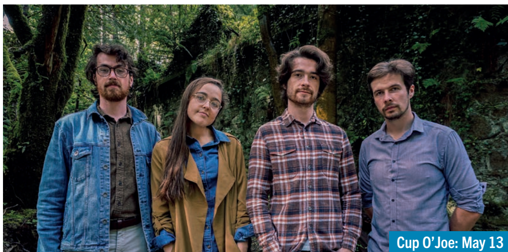
Cup O'Joe: May 13

The following week Cup O'Joe take to the stage. A progressive bluegrass and folk band founded and based in Northern