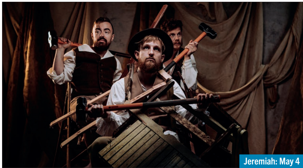
Jeremiah: May 4

As the summer season approaches we still have some captivating theatre for you to enjoy at Ropery Hall.