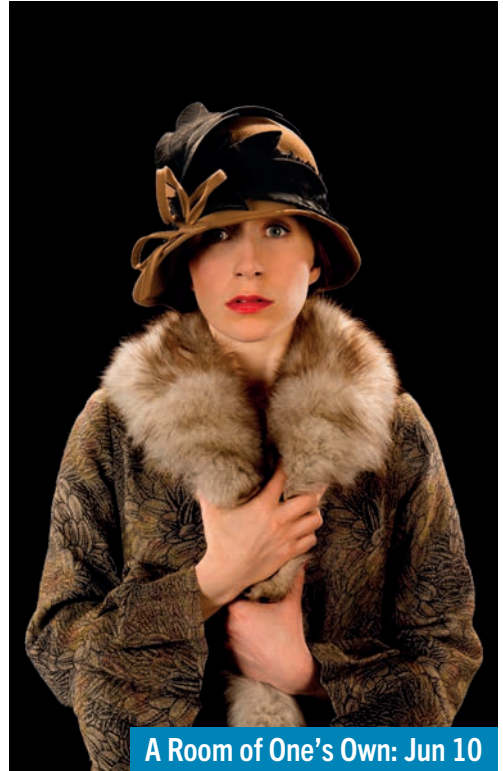
A Room of One's Own: Jun 10

Skilfully distilled from Jerome K Jerome's comic masterpiece this is 95 minutes of pure delight