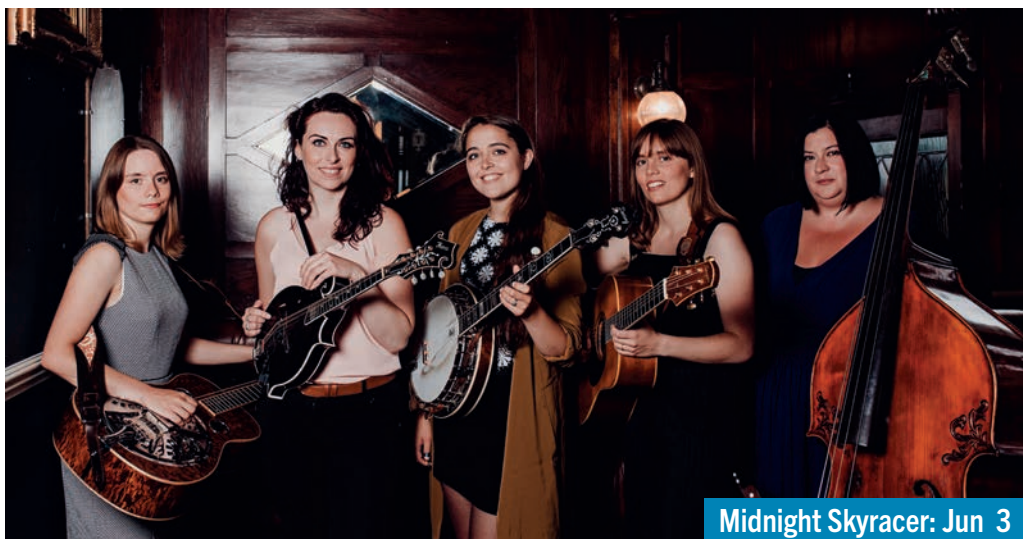
Midnight Skyracer: Jun 3