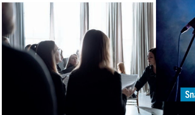
Choir Festival Jun 26